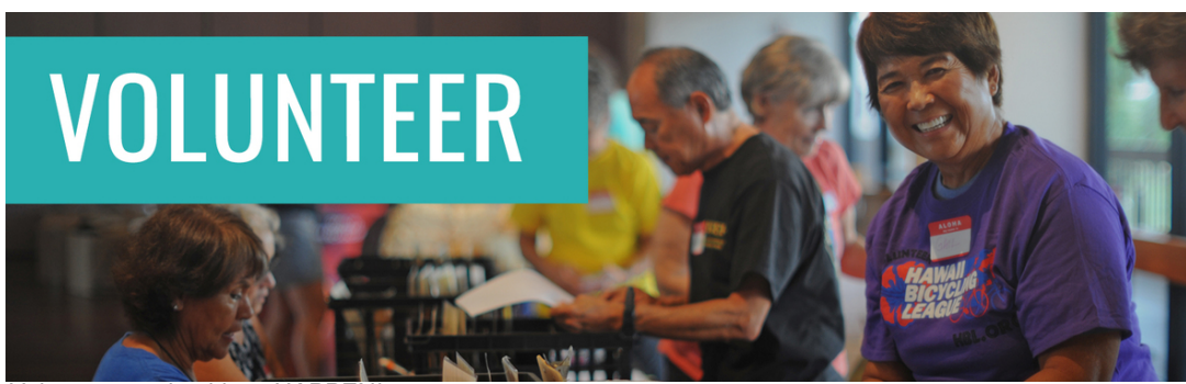
Volunteers make things HAPPEN!

Instagram: @hblridealoha Facebook: www.facebook.com/hblridealoha