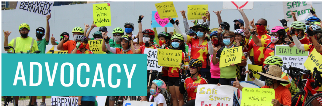
Together we're making Hawai'i more bicycle friendly everyday!