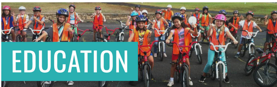
Education from keiki to kūpuna, for motorists & cyclists.

Calling all HBL volunteers! With the Honolulu Century Ride coming up this September, we need your help to prepare and run the event! We have positions available before, during and after the event, ranging from packet stuffing to medical support! Sign up using this link: Volunteer Sign Up . If you have any questions or concerns, please email Lauren at lauren@hbl.org